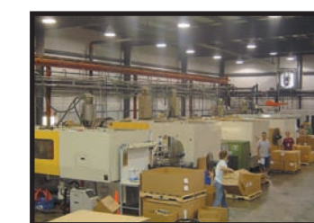
A peek inside the new manufacturing space at Sturgis Molded Products Co.