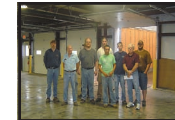
Warehouse and maintenance staff at LTI Printing pose in front of new loading docks, a part of the company's recent expansion project.

LTI Printing, a locally owned and operated printer of pressure sensitive labels and folding cartons, recently completed a building expansion and improvement project. The facility additions and remodeling targeted enhancements to product flow and material storage efficiency. The largest building addition provided ground level access, four loading dock structures, provisions for a waste compactor, and a new chemical storage room. A key element was the large staging area for improved material receiving and product shipments to destinations throughout the U.S., Canada, and Mexico. Building improvements included the reclaiming of internal truck docks to utilize the floor space and higher ceilings for storage efficiency. This successful project was achieved with special cooperation from corporate neighbor Parma Tube and the City of Sturgis. A sincere thank you also goes out to all LTI employees who continued to produce quality product during this time of construction.